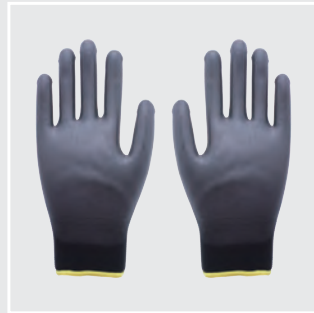
PU Palm Fit