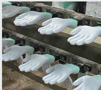
PU Palm Coating