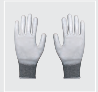
ESD PU Palm Fit