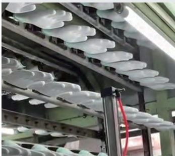
PU Top Coating