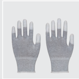
ESD PU Top Fit