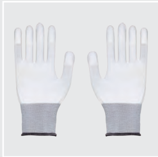
PU Top Fit