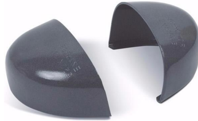
Steel Toe Cap 200J